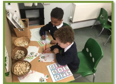
Our Whole school Project on Alice in Wonderland has inspired fantastic writing and speaking and listening opportunities across the school, including tea party invitations and hot seating of both Alice and the Mad Hatter!